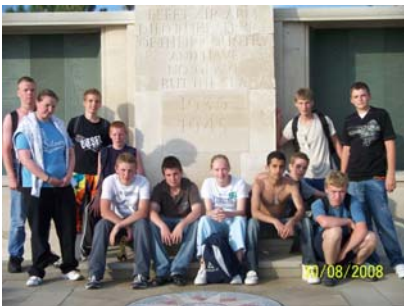
The cadets visit the Fleet Air Arm Memorial